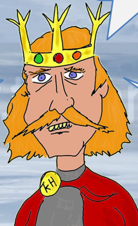
Harold of Wessex

I was crowned King the day after the death of Edward