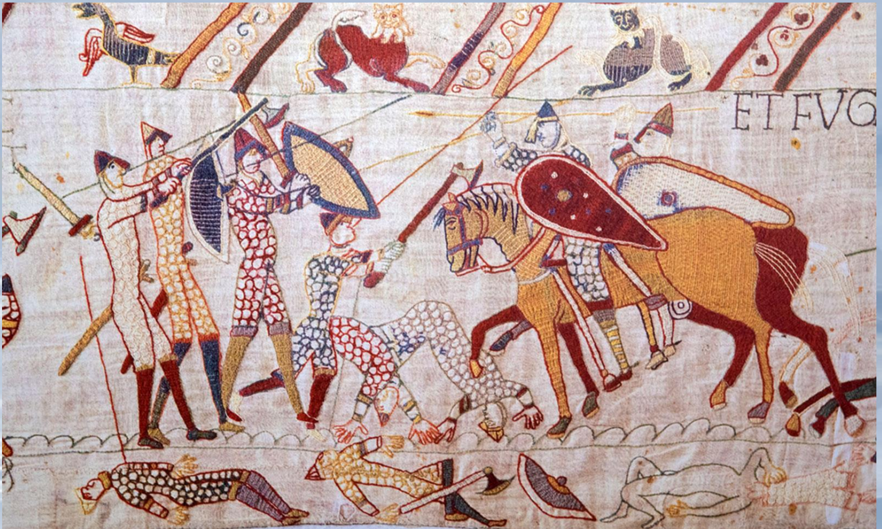
The Bayeux Tapestry