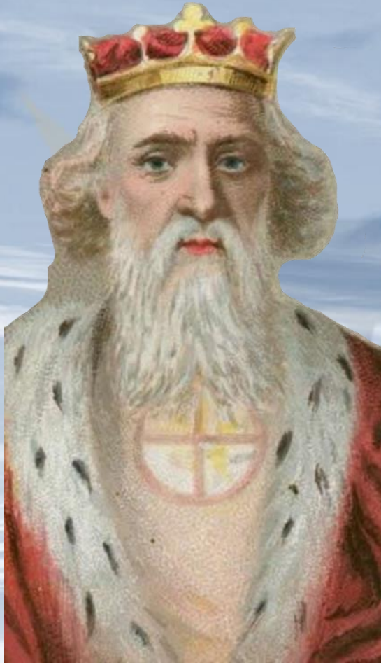
Edward the Confessor